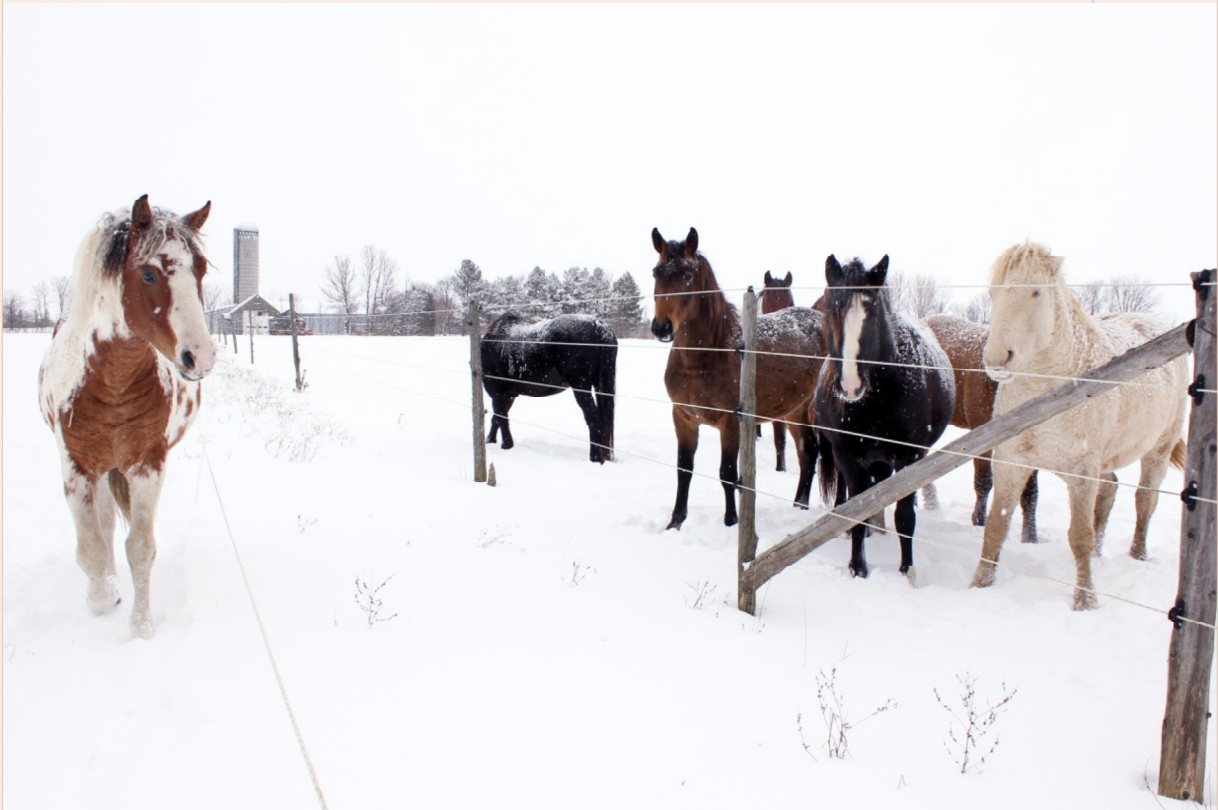
Hélios, 1264-D, and lady friends (Namaspamoos Hélios de Sally)

Some years ago, our herd was made of three stallions and a dozen mares, plus several youngsters. Curlies from our breeding have been - and still are - used to establish new breeders, mostly in France and Germany, but you can find some of our babies in Belgium, Switzerland, Spain and England too, as well as in Canada and in the US.