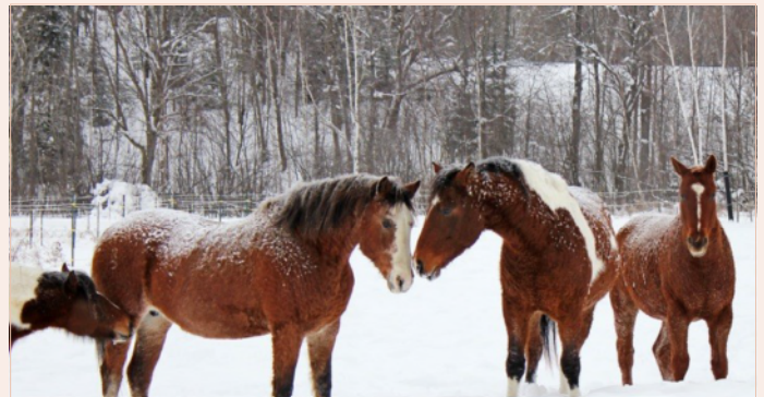
Pimbina, ICHO 1275-S