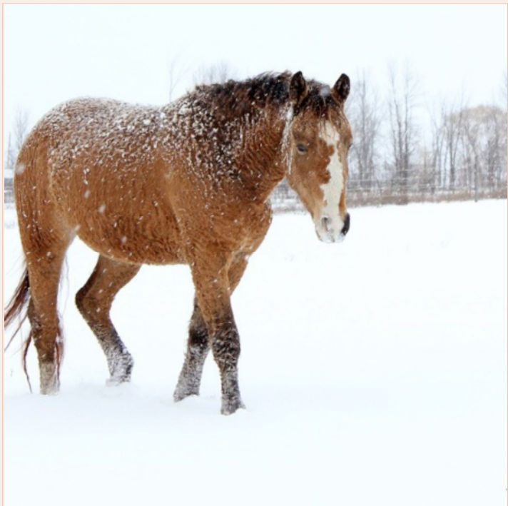
GMC Andrea's Ankti, ICHO 1717-D.