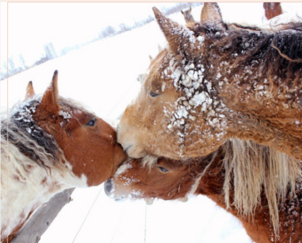
Hélios, ICHO 1264-D, Ankty and Pistache, ICHO 1181-D.

Sixteen years ago, with the great support of my wonderful husband, I was finally ready to start our own horses' breeding program. The plan was to breed Canadian Horses, or perhaps, Friesian, both breeds were appealing and we had done all our homework. The only red flag was that my mother-in-law and one of our niece's were highly allergic to most animals' hair, especially horses. So, almost as a joke, we looked on the internet to see if a hypoallergenic horse would exist - I was pretty sure not, as I was into horses for 30 years and I had never heard of such a breed; but it is how we discovered the Curly.