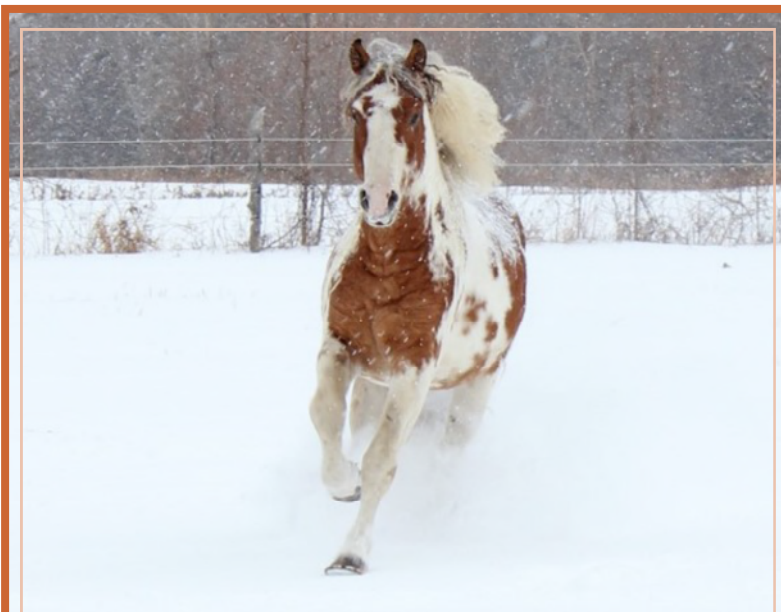
ICHO Feature Farm presents Namaspamoos, above, their stallion, Hélios, 1264-D, (Namaspamoos Hélios de Sally).