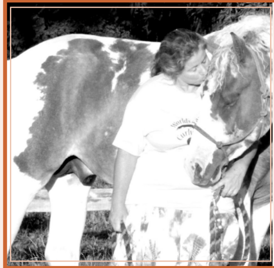
Right, with my lovely stallion, Hélios, 1264-D, (Namaspamoos Hélios de Sally) when he was 3 years old (2012).

Today, I am less often in plain view of the Curly world, working and helping more through private communications an on forums or FB. I am always happy to help the ICHO office, or other fellow Curly enthusiasts, with translations from French or to French, giving an hand where I can. We welcome visitors and interns (trainees), mostly from Europe, with whom we are sharing our views and love of life, especially when some Curly horses are well rooted in it.