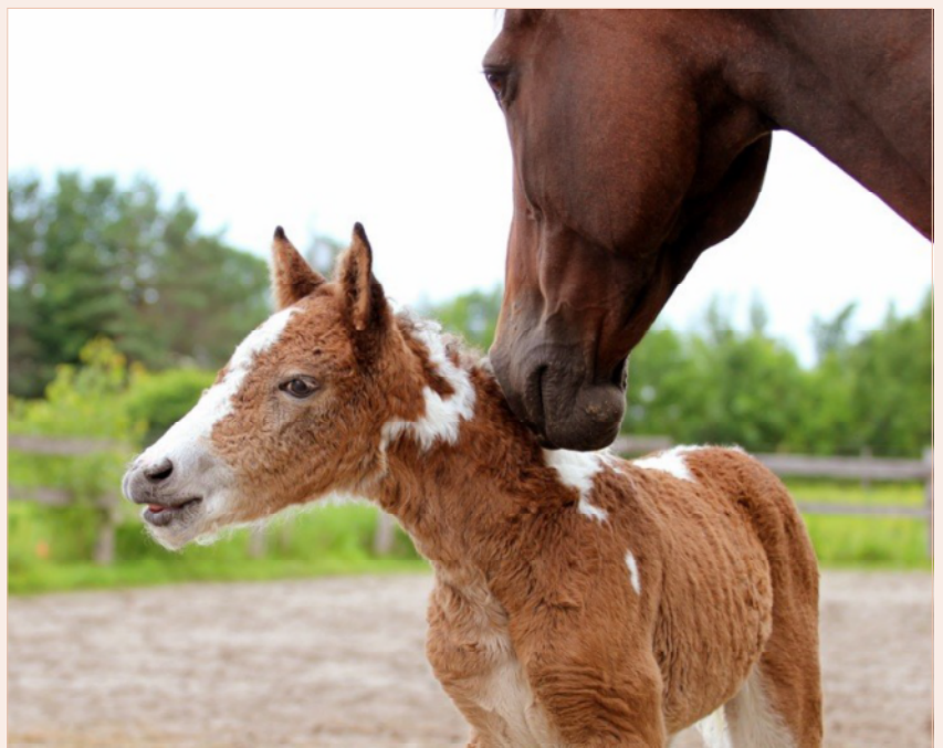
Fée (Namaspamoos Fée Lady d'Hélios), who lives now in France (Lady x Hélios).