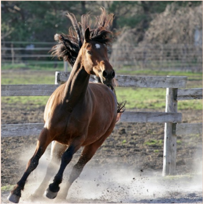
Azarah (Namaspmoos Azarah Passion) who lives in Switzerland.