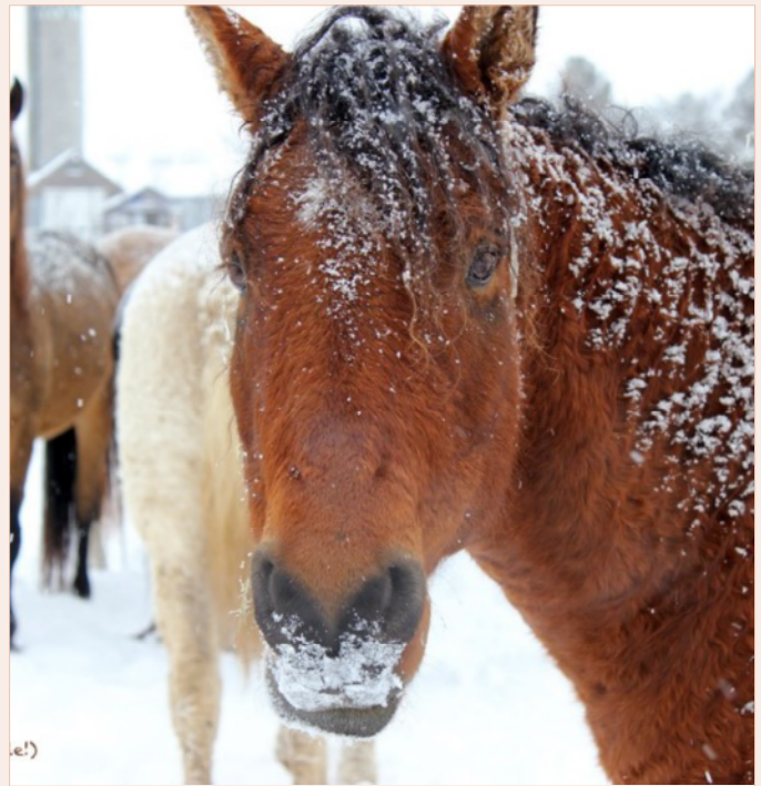
Namaspmoos Baabul d'Insy ICHO 1274-D.