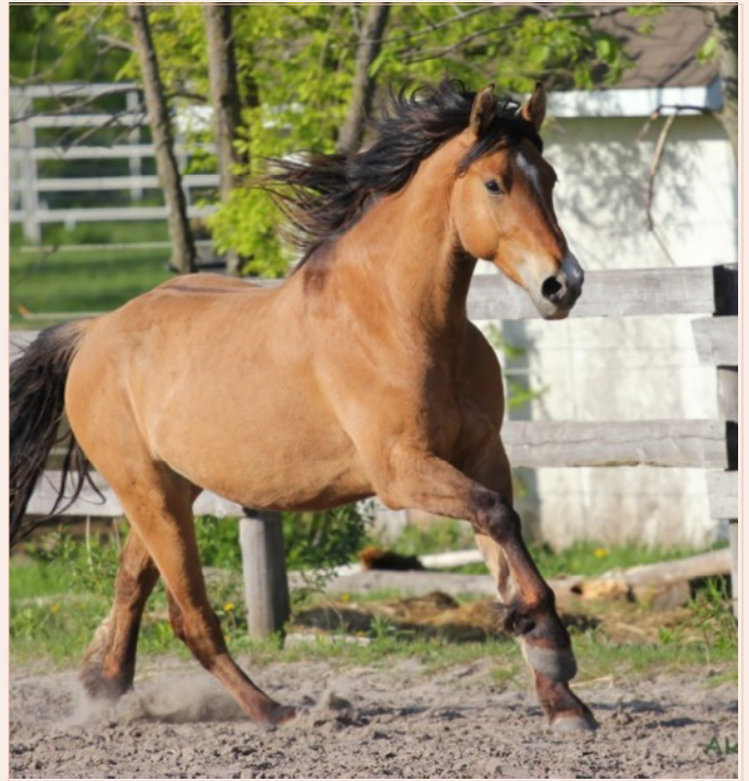
Akilédou, ICHO 1276-S, the son of Augustine (Curly mustang mare, now 28 years young).