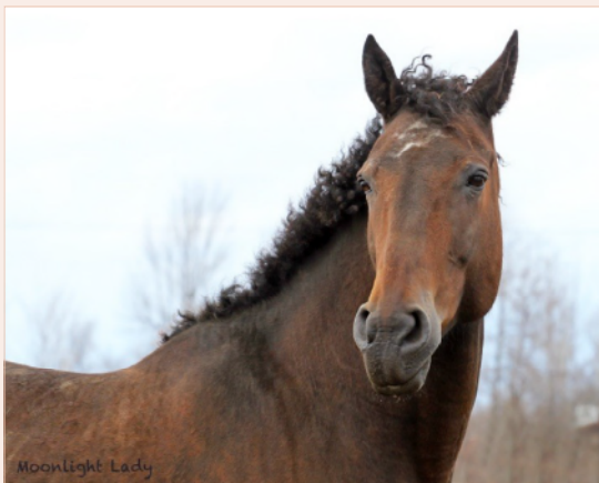
RR Moonlight Lady (Lady), ICHO 841-D.