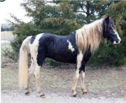
Micco's Curly Spots Hot Stallion * Year of Birth 2009 Curly