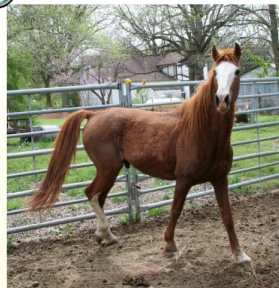
Reference Sire ONLY Sun Dance T Year of Birth 1986 Curly Status Unknown