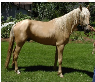
Reference Sire ONLY DCC Golden Ladd Year of Birth 2001 Curly Last Known Status Resides in California