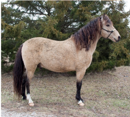
Sun Dance's Superstar Stallion * Year of Birth 2007 Curly