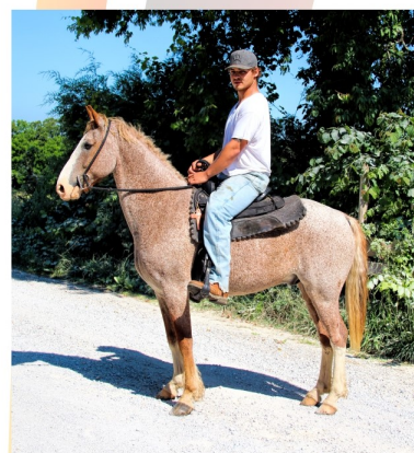
Sun's Prime Legacy Year of Birth 2007 Red Roan, Curly

After 50+ Years of Breeding Quality Missouri Fox Trotting Horses, Straight and Curly I am RETIRING! I've saved the best for last!