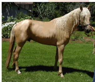
Reference Sire ONLY DCC Golden Ladd Year of Birth 2001 Curly Last Known Status Resides in California