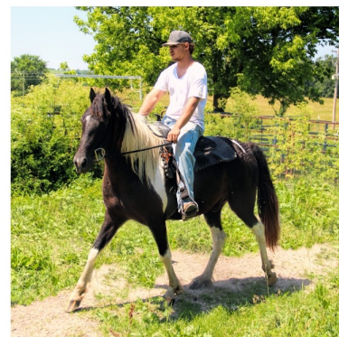
Spots Curly Honia Shazam Year of Birth 2012 Blk/White Tobiano, Curly