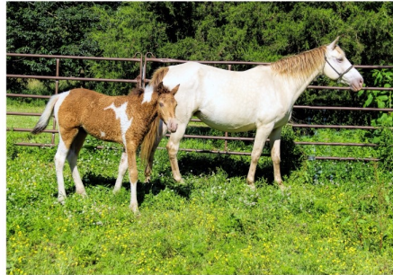
Dam: Image's Dunette Year of Birth 2001 Color; Amber Champagne, Straight with Bay/Wh, Curly Tobiano born 2017