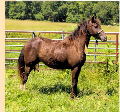
Spots Curly Yahto Lye Year of Birth 2012 Smokey Black, Curly