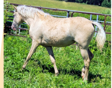
Stars Curly 14 Karat Year of Birth 2015 Gold Champagne, Curly