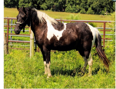
Spots Shazoom Elan Year of Birth 2013, Curly