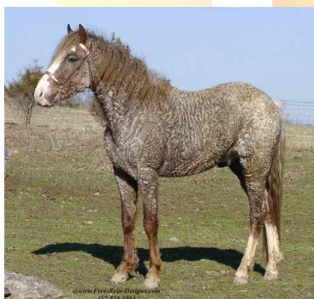
Reference Sire ONLY Sir Patrick Maximum Year of Birth 2000 Curly Status Resides in Germany