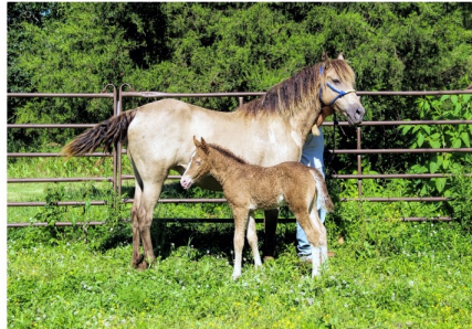
Dam; Dun Dees Shirley Curly Year of Birth 2006 Color; Amber Champagne, Curly with Sable Curly born 2017