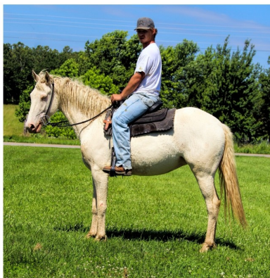
Stars Curly Tehya Misae Year of Birth 2012 Perlino, Curly