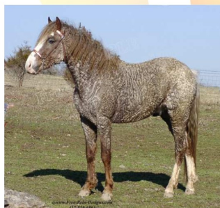
Reference Sire ONLY Sir Patrick Maximum Year of Birth 2000 Curly Status Resides in Germany