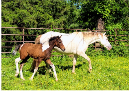
Dam: BKs Southern Image Year of Birth 2012 Color; Amber Champagne, Straight with Bay/Wh, Curly Tobiano born 2017