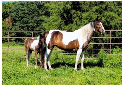
Dam; Lads Precious Ivy Year of Birth 2005 Color; Bay/Wh Tobiano, Minimal Curly with Blk/Wh Tobiano, Straight born 2017