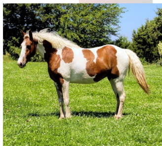
Max's Rainy Day Curl Curly Mare NOT FOR SALE