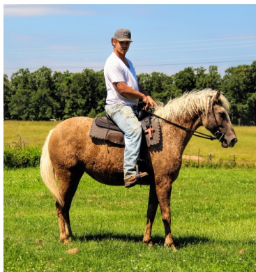
Stars Curly Lady GaGa Year of Birth 2011 Brindle, Curly