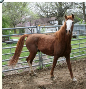
Reference Sire ONLY Sun Dance T Year of Birth 1986 Curly Status Unknown