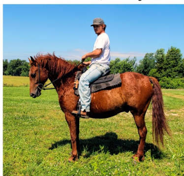
Micco's Lootah Marko Tear Drop Year of Birth 2012 Sorrel, Curly