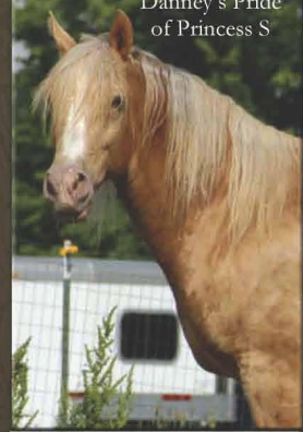
Danney's Pride of Princess S