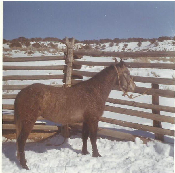
Pee Wee 1969